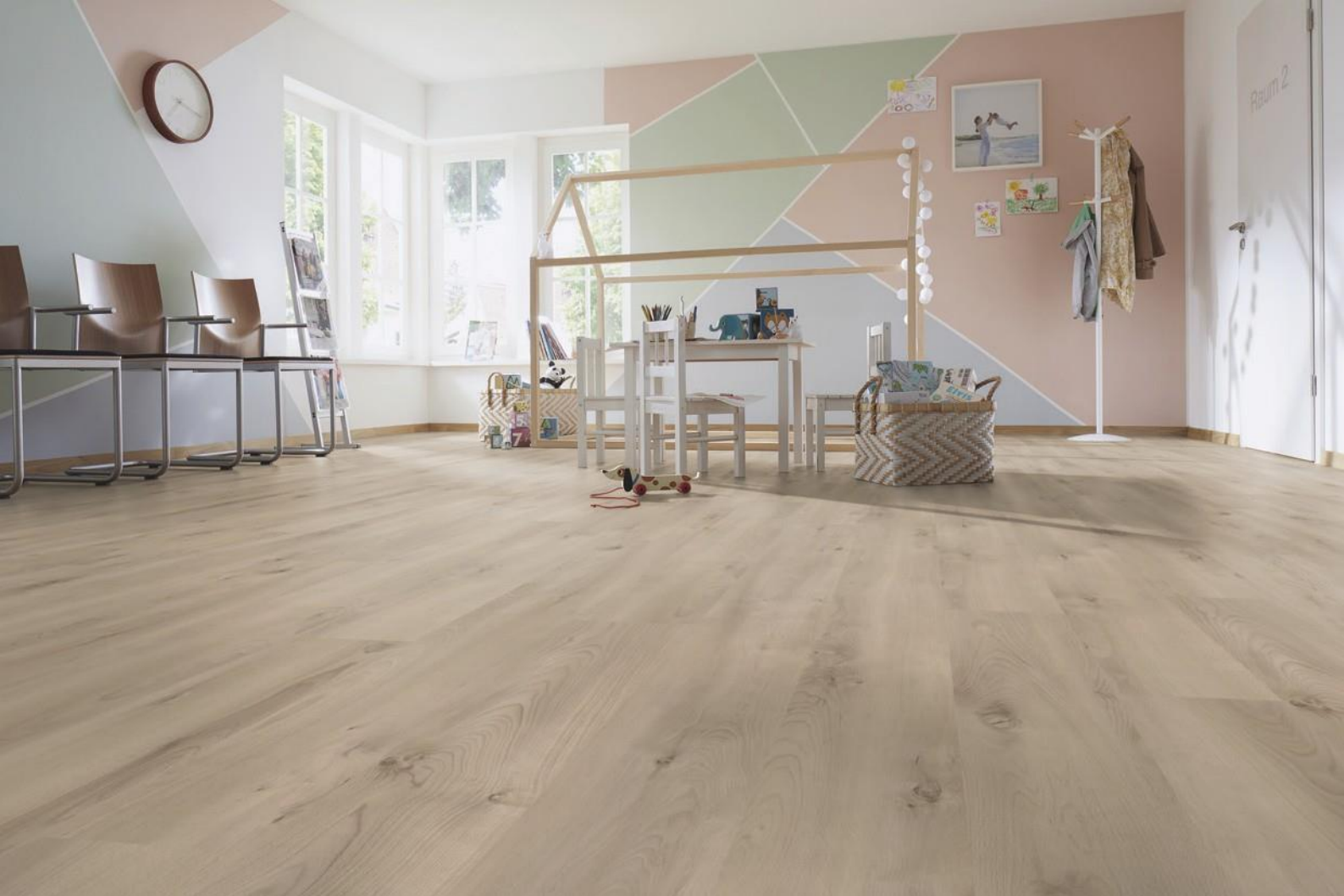
Lorine Light – D4991