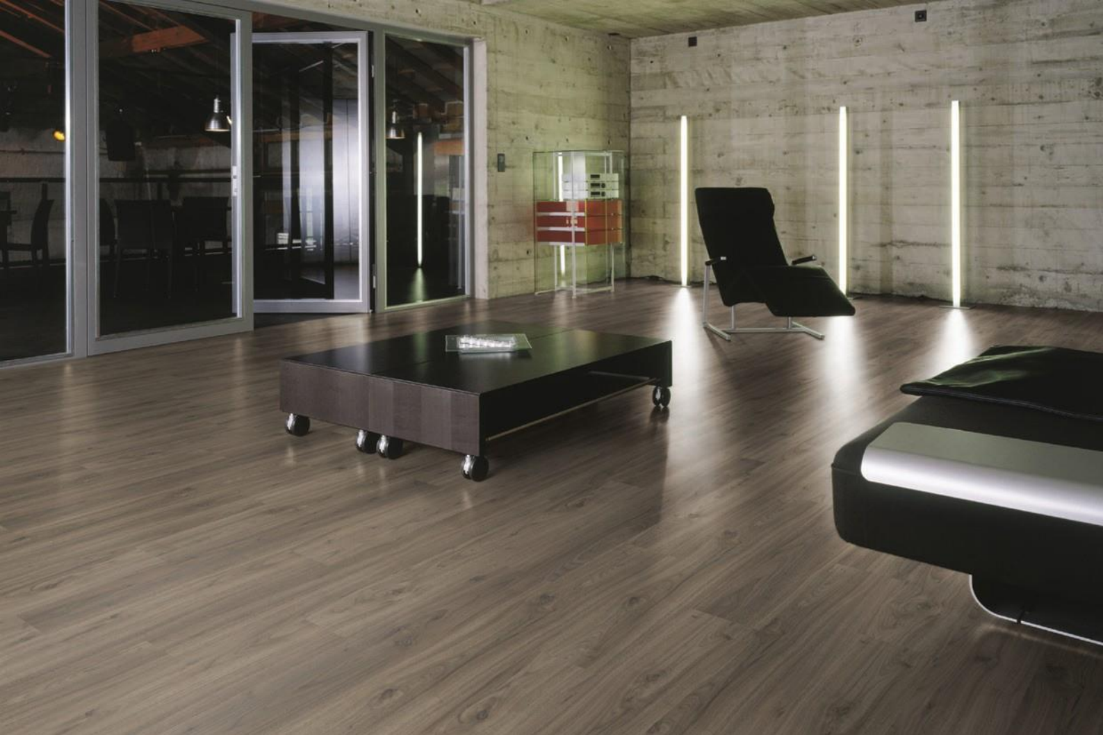
Walnut Palazzo – D4757