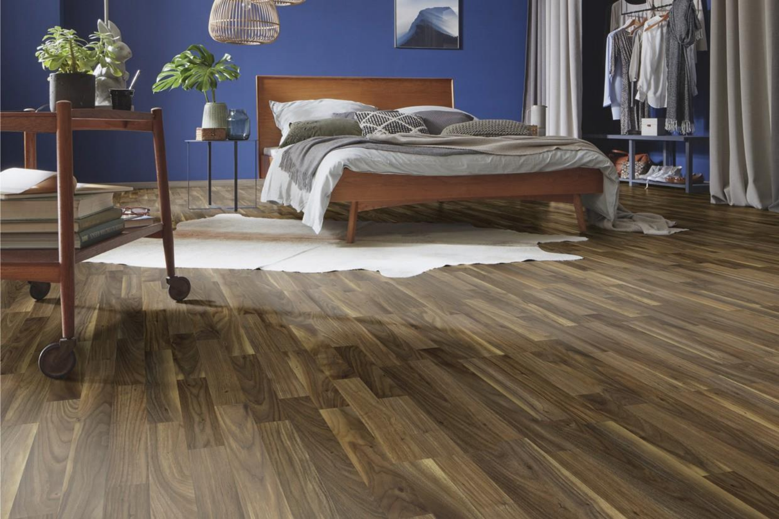
Walnut Historia – D4773