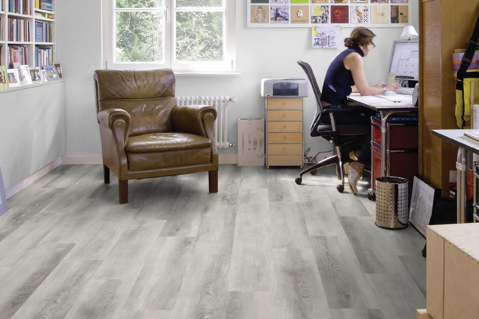
Barrow Oak – D4781