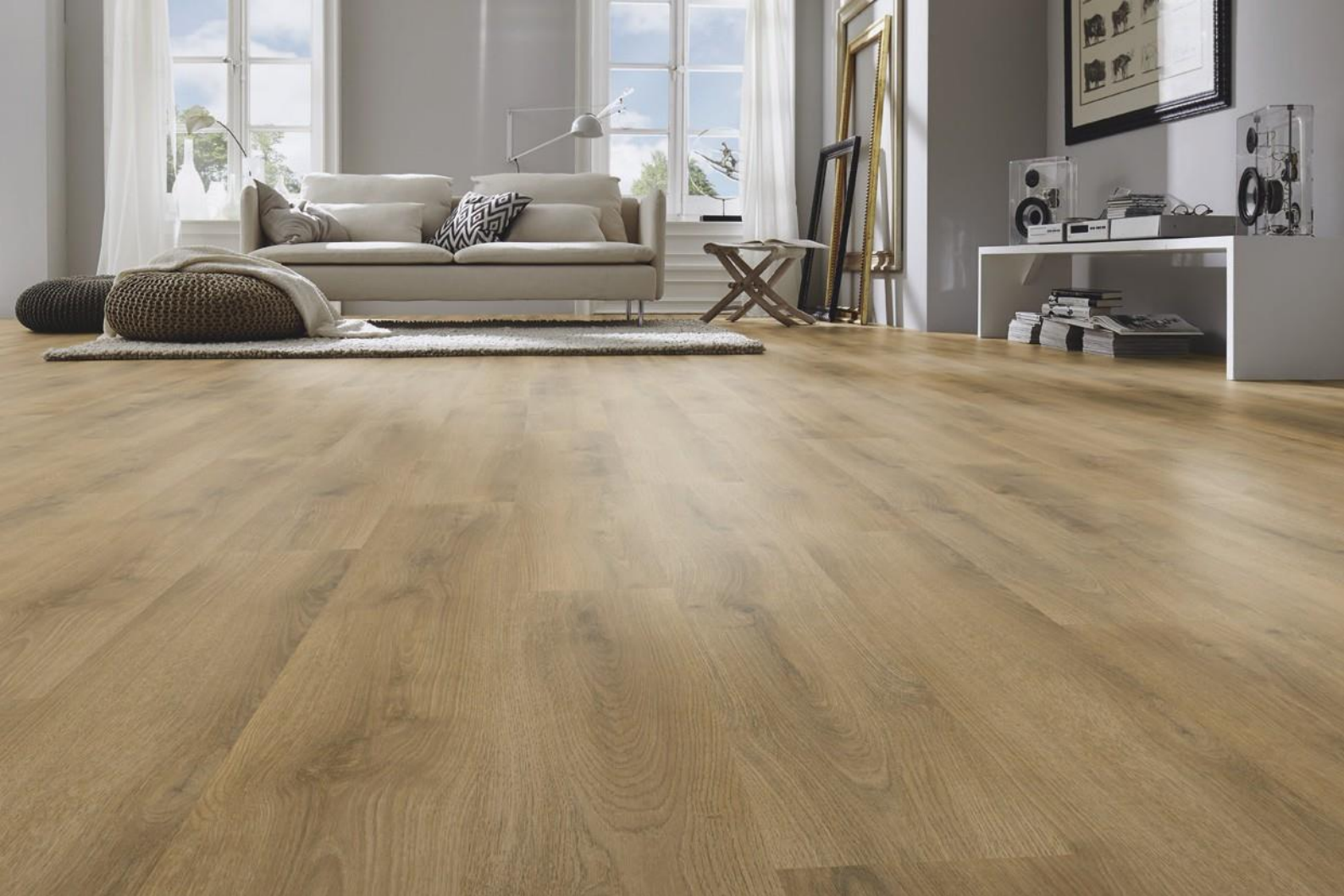
Elbe Oak – D3901