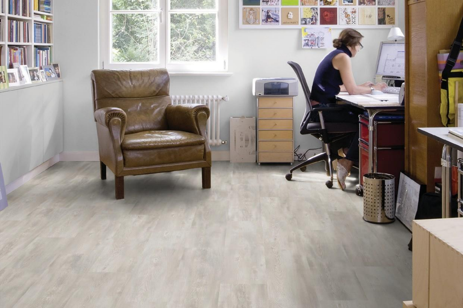
Nevada Pine - D4127